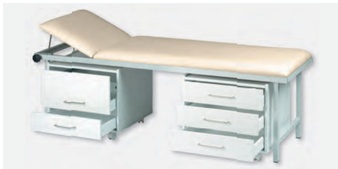
1 SW-470/2, SW-470/3, U-1065

The drawer units, mobile drawer units and multi-purpose mobile cart offer versatile, mobile storage for supplies and equipment. The body of the units and the drawer fronts are made of white melamine-coated panels, thickness 16 mm.