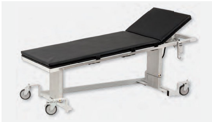
1 RGL-1080/NKEE (Headrest to the right), PAL-190-80, OPS-170/A, LR-125 (H : 550-800 mm)