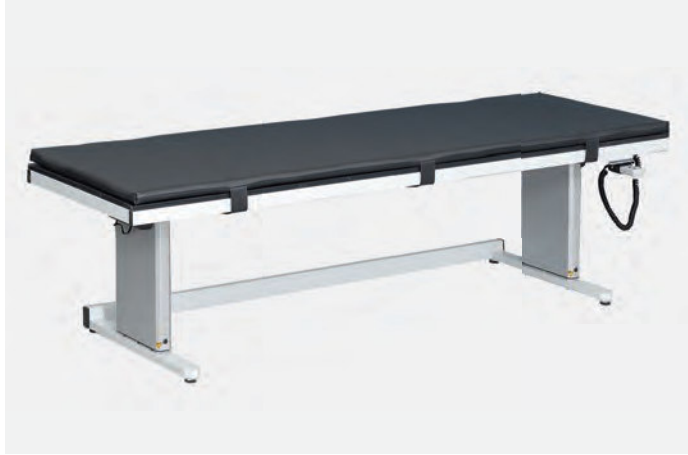
1 RGL-1065/EE, PAL-190-65

Additional features and options for these products are described in details on catalogue page 26.