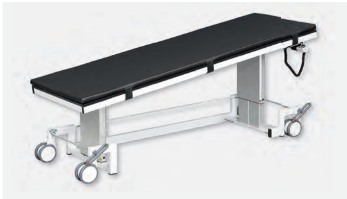
2 RGL-1065/NEE, PAL-190-65, LR/Z-125 (H : 550-800 mm)