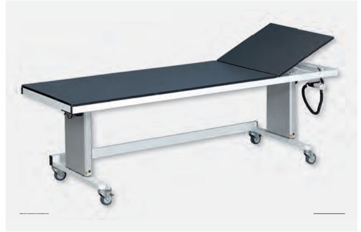
3 RGL-1065/KEE (Headrest to the right), LR-75 (H: 650-900 mm)