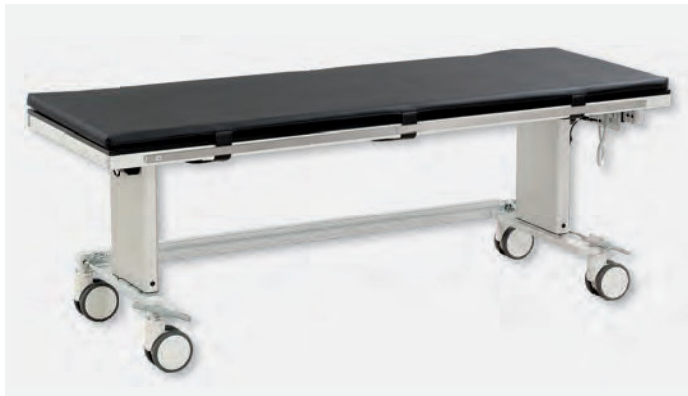
3 RGL-1065/EE, PAL-190-65, OPS-170/A, LR/Z-125 (H: 700-950 mm)