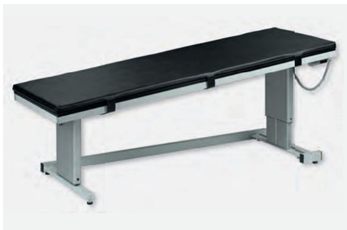
1 RGL-1065/NEE, PAL-190-65

The X-ray tables with height and tilt adjustments (electric and battery powered) can be found on this page. Additional features and options for these products are described in details on the next page.