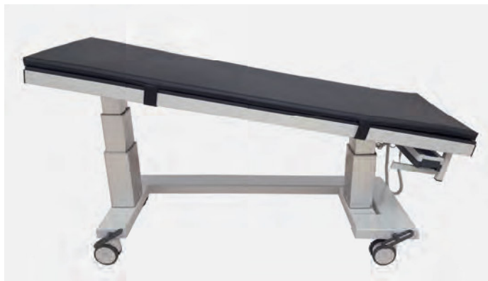
4 RGL-1065/NAC, PAL-190-65, LR/Z-125 (H : 620-1020 mm)