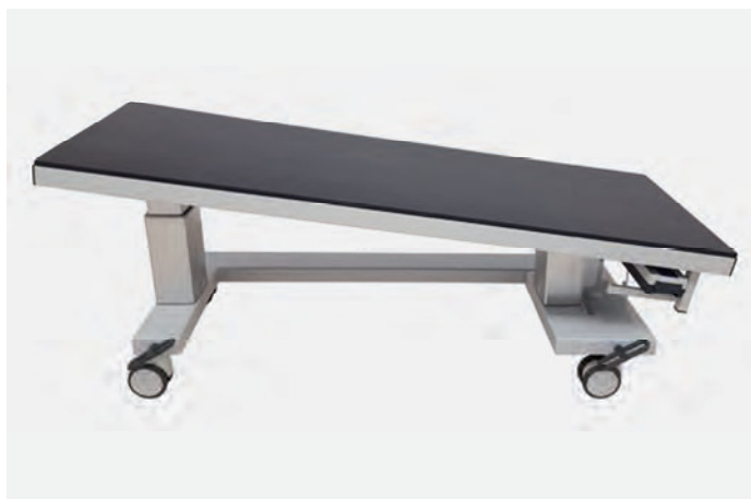
2 RGL-1065/NAC, LR/Z-125 (H : 620-1020 mm)