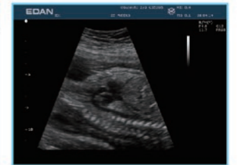
Speckle Reduction Imaging 25-week OB