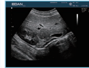
Harmonic Imaging Liver, Kidney