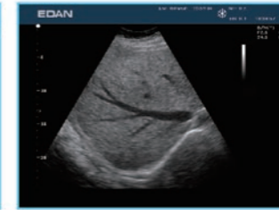
Superior Penetration Body Mass Index of 60