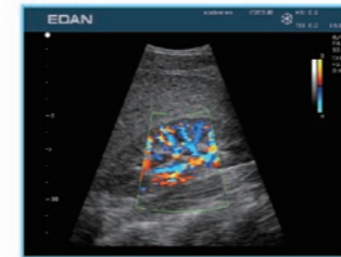
Color Doppler Sensitivity Kidney