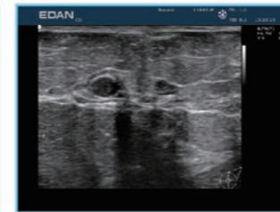
High Frequency Imaging Complex Breast Cysts