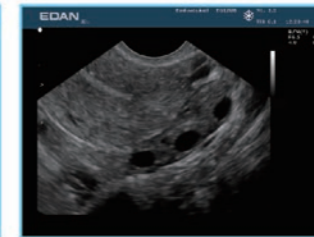
Endovaginal Imaging Uterus and Ovary